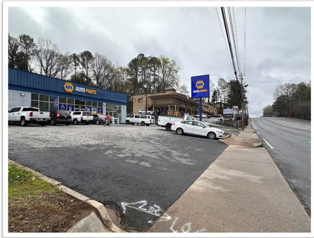
Frontage along Buford Highway