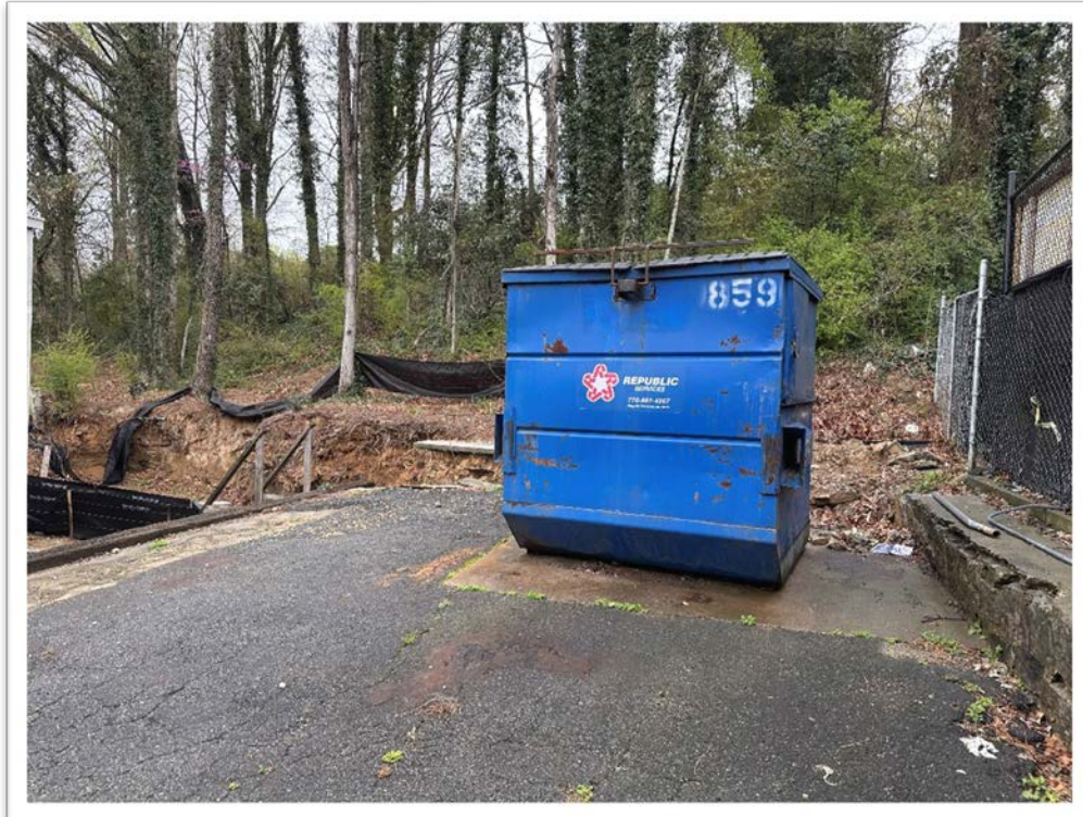
Dumpster location at the southeast end of property. Situated in the side yard.