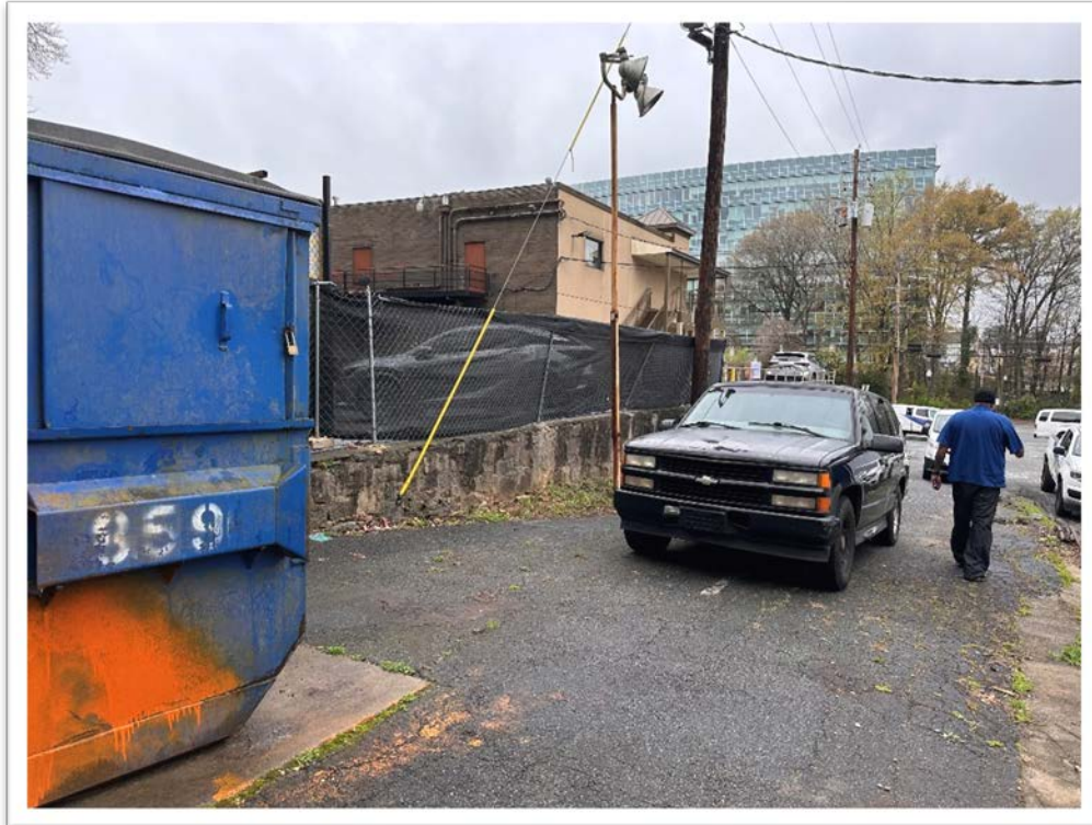
View of access to dumpster