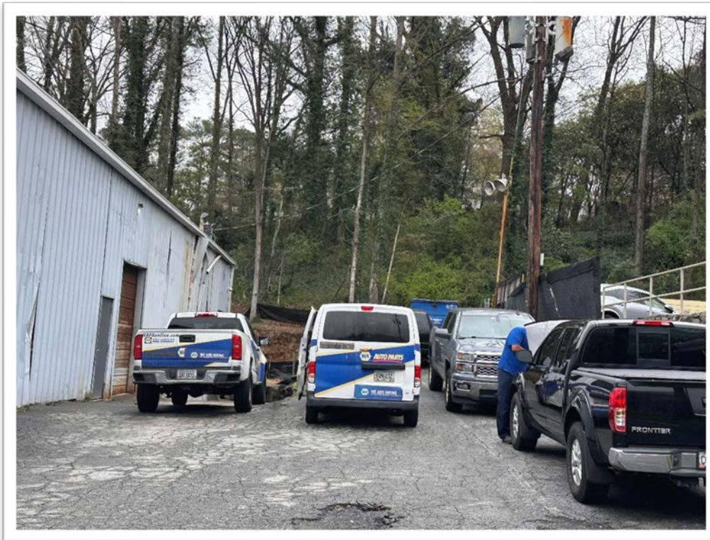
Side yard access as seen from the parking lot