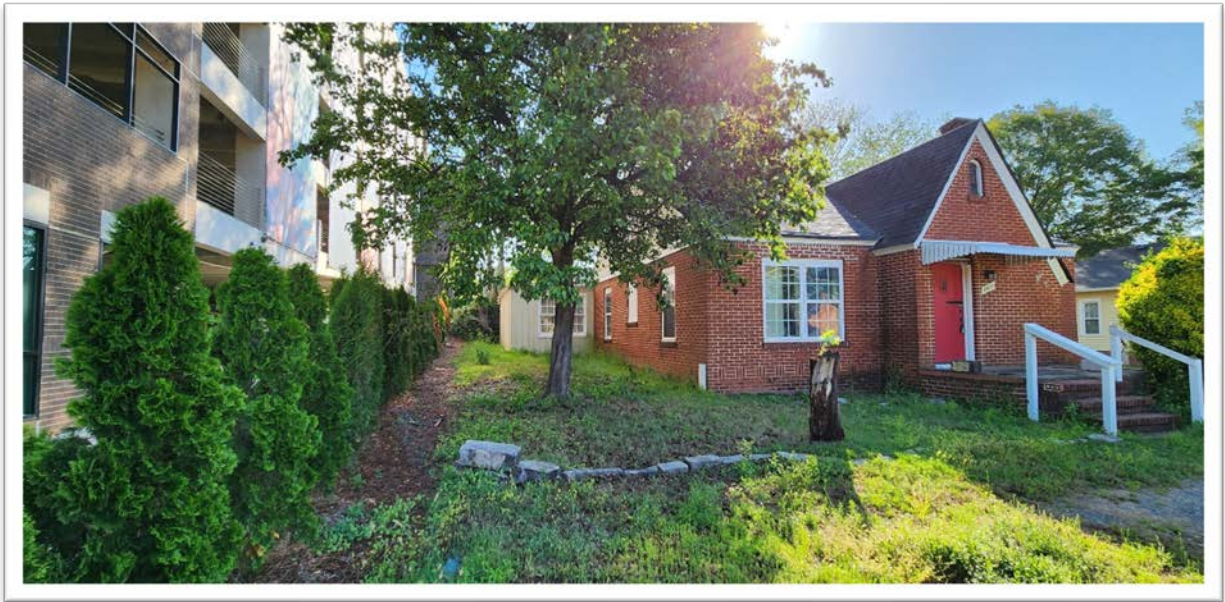
Left side yard adjacent to the Bexley Apartments