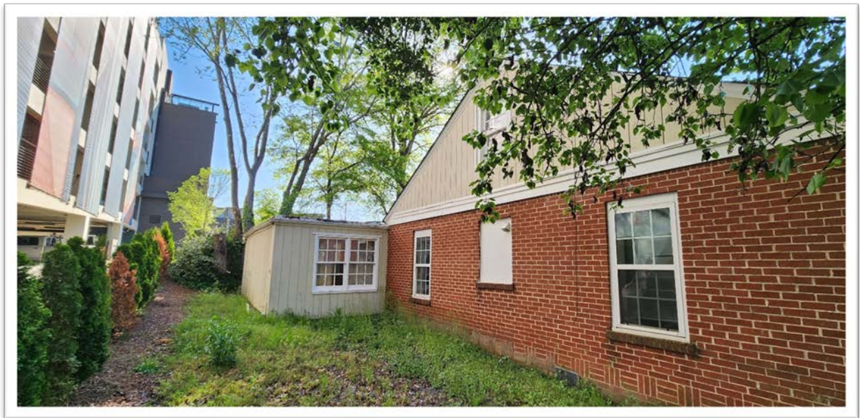
Rear room to be renovated to increase ceiling height