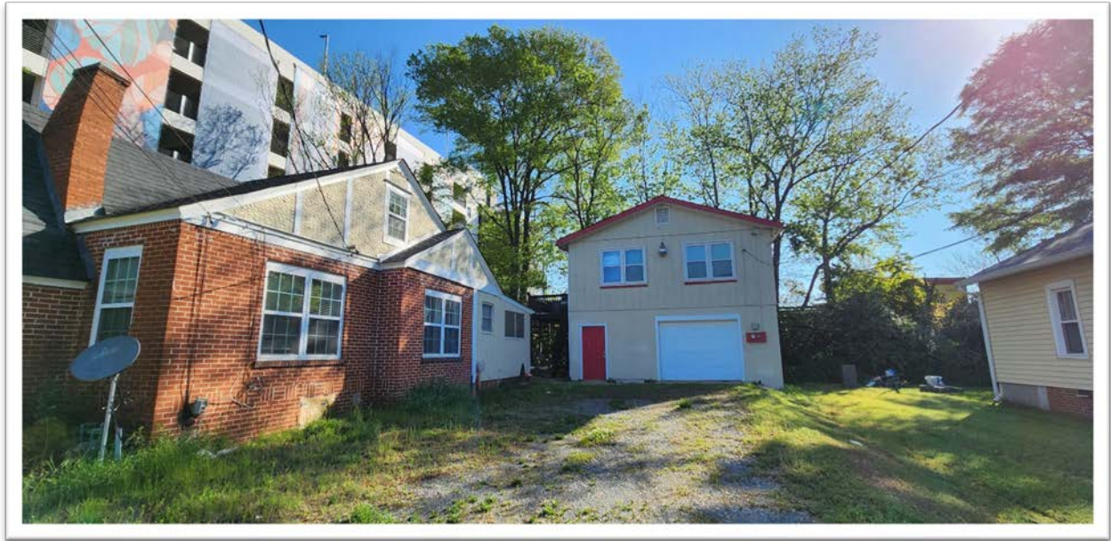
Right side yard with accessory structure and existing gravel driveway