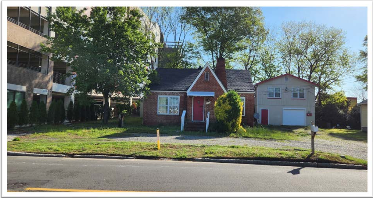
Frontage along Chamblee Dunwoody Way