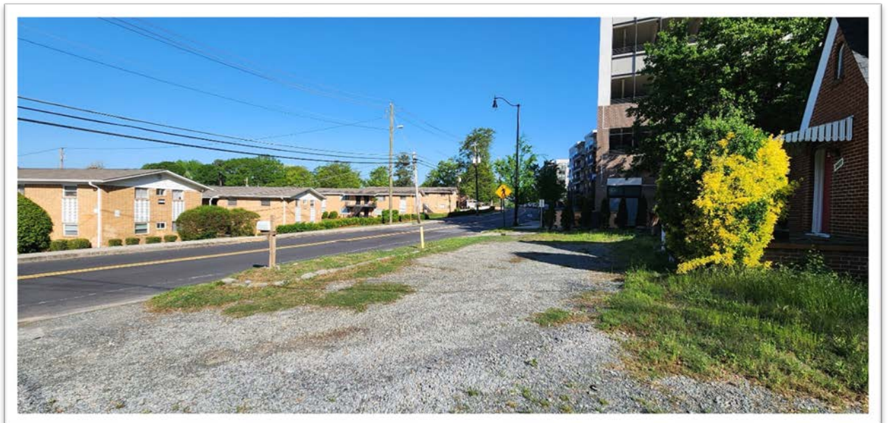
View of existing front yard and driveway curb cuts