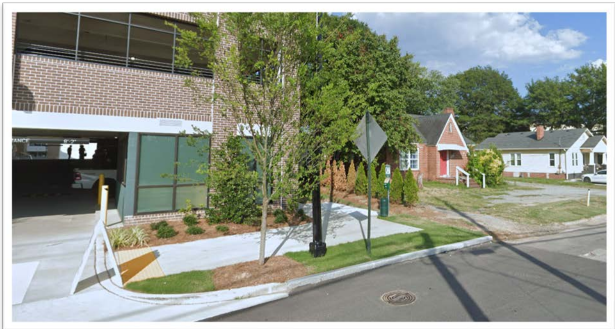
View of adjacent sidewalk from Bexley Apartments